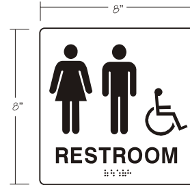
Sign Type A - Restroom - Series 100 8 x 8" 1/8" Modified Acrylic - 1/4" Radius Corners Sapphire Background - White Lettering (Helvetica) ADA / Raster Braille Double Faced Tape All Restroom Accessible (Wheelchair Symbol)